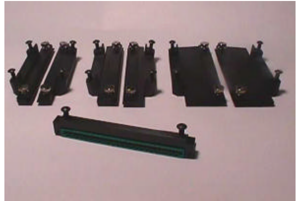
Additional Rail Sets

Rails can be changed to accommodate different width probe cards. To order additional rails please specify: Additional Rail Set ESI-ARS-4.5, 6.0 or 6.5